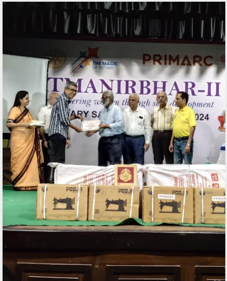
Received Sewing machines at Rotary Sadan, Kolkata 10 th Oct'24